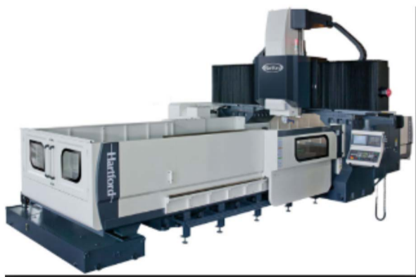
Hartford Milling Machine-HSA 636-EAY