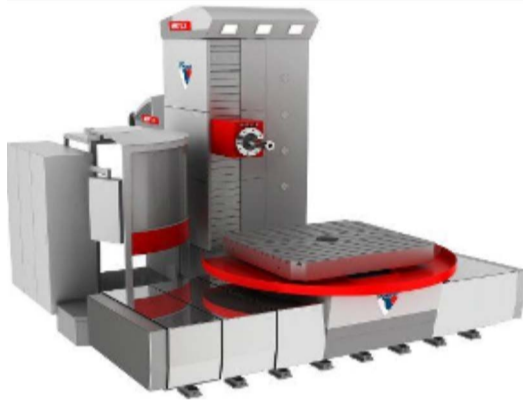
Fermat Horizontal Boring and Milling Machine-WFT13 R CNC