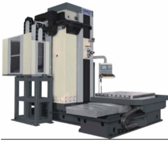
Femco Horizontal Boring and Milling Machine-135TN