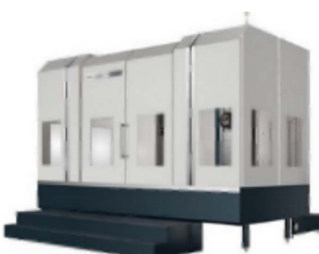
Hartford Horizontal Boring and Milling Machine PBM-135