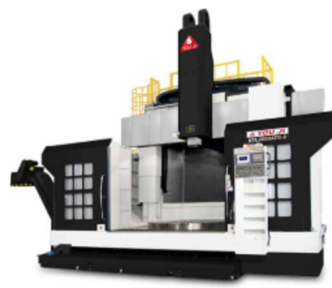
YOUJI Vertical Lathe - vt1250atc+c-i