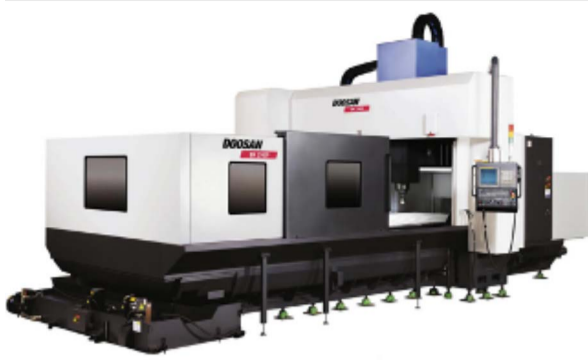
Marla Doble Column Milling Machine- HD3000